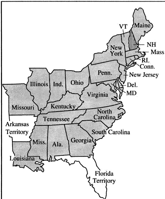
PRESIDENTIAL ELECTION, 1820